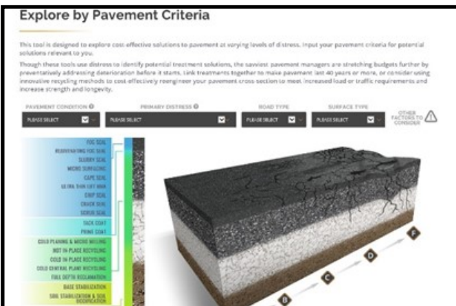
Explore by Pavement Criteria

Demand is increasing for asphalt emulsions, preservation and recycling. However, local agencies are still unaware of benefits and best practices to successfully choose and apply these treatments.