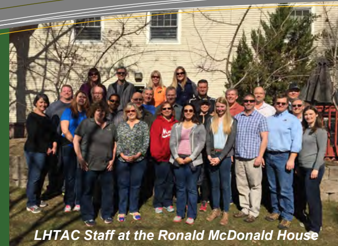
LHTAC Staff at the Ronald McDonald House