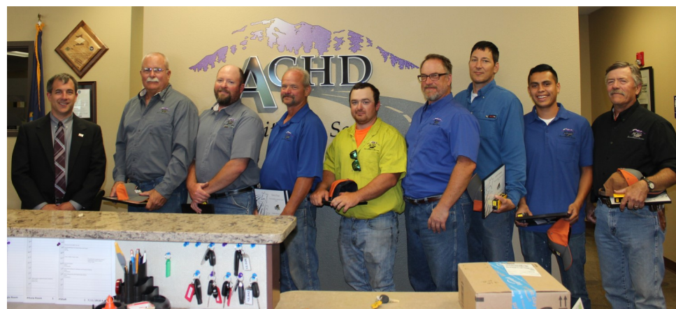
Ada County Highway District Road Scholars