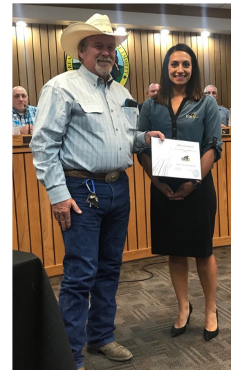
City of Emmet Road Scholar and Master