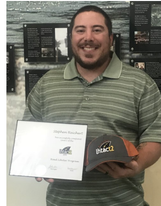
City of Post Falls Road Scholar