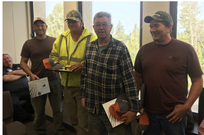
Bonner County Road Scholars