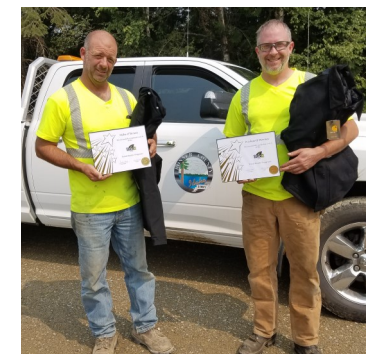
Bonner County Road Masters