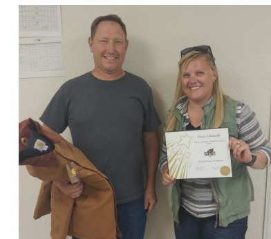
Ferdinand Highway District Road Master